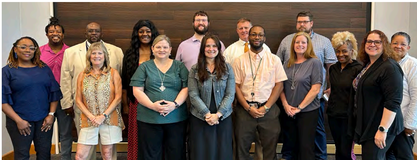
Members at the May 19 - HTDPC General Membership Meeting

HISTORIC TRIANGLE DRUG PREVENTION COALITION